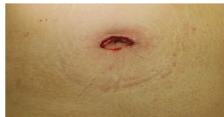
Figure 3 – Immediately post-procedure

For more information on the LiVac Retractor system, please contact your representative or go to livac.com