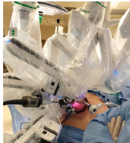
Figure 1 – SILS Da Vinci Xi set up

The patient was reportedly satisfied with the single incision approach and the cosmetic result.